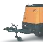
Heavy Duty Adjustable Tow Bar